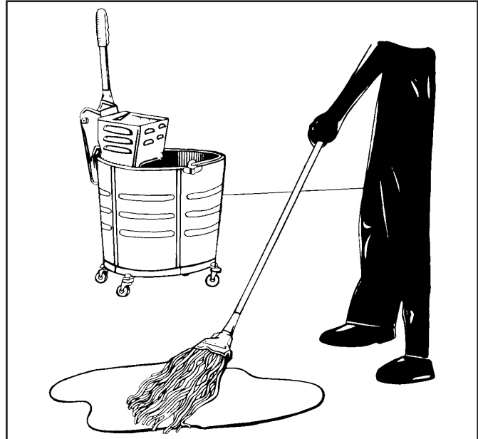
Figure 3. Applying the Statguard® Low Residue Floor Stripper with a cotton mop