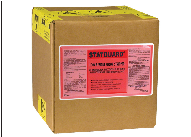
Figure 1. Statguard® Low Residue Floor Stripper