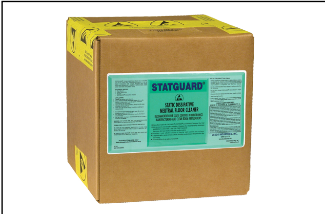
Figure 1. Statguard® Dissipative Neutral Floor Cleaner